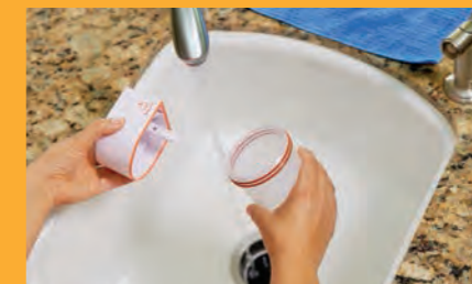
3) Wash out the collected mucus by water