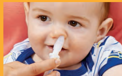
1) Place the tip to the baby's nostril